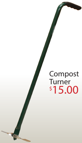
Compost Turner $15.00