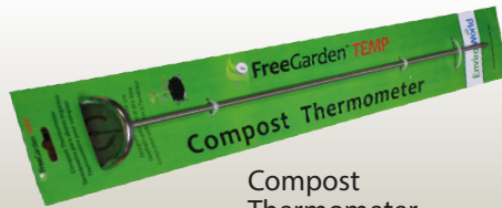
Compost Thermometer $15.00