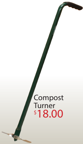
Compost Turner $18.00

Adjusted price with Town of Hampton $7 subsidy