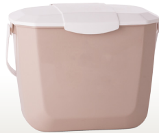
Kitchen Scrap Pail $12.00