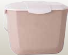
Kitchen Scrap Pail $12.00