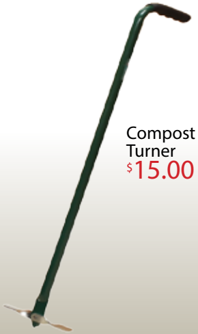
Compost Turner $15.00