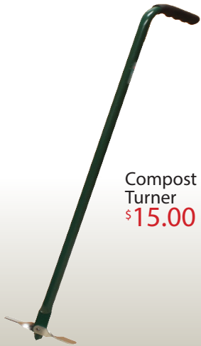
Compost Turner $15.00