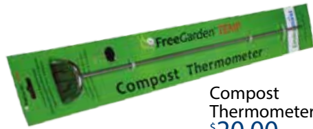
Compost Thermometer $20.00