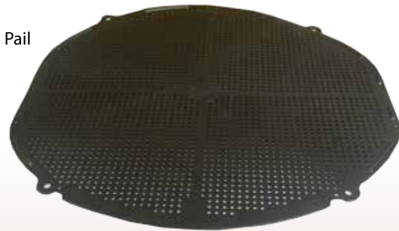
Compost Bin Mesh Bottom $15.00