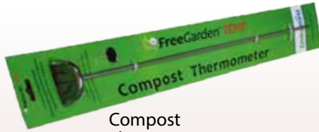
Compost Thermometer $20.00