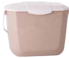
Kitchen Scrap Pail $12.00