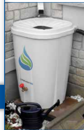
FreeGarden RAIN® 55 Gallon Rain Barrel $70