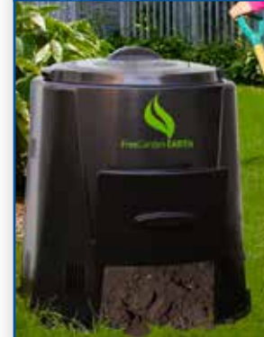
FreeGarden™ EARTH Compost Bin $60