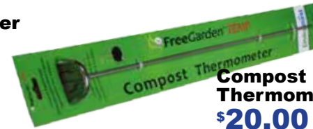
Compost Thermometer $20.00