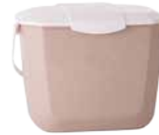
Kitchen Scrap Pail $12.00